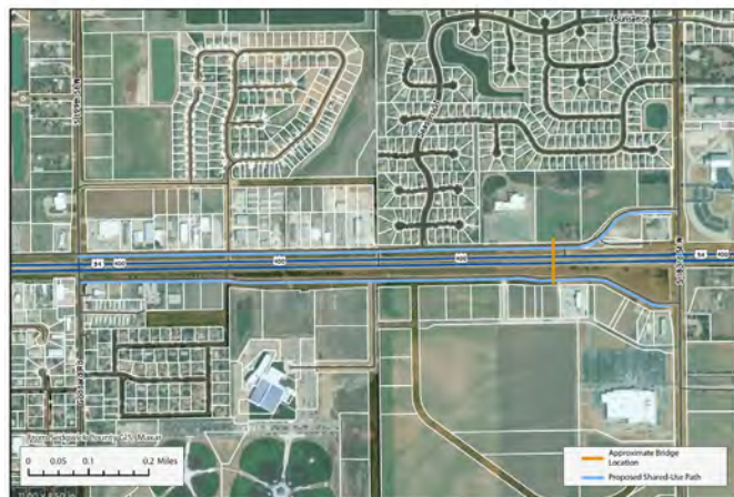
Proposed Shared-Use Paths and Bridge Location

The primary barrier to community connectivity in Goddard is US-54/400. The highway virtually eliminates the ability for pedestrians or cyclists to move north and south in the City without driving. The highway's presence is a challenge as neighborhoods, businesses, churches, parks and other activity centers are on both sides of the highway. This highway is expected to become more of a barrier to community connectivity as KDOT is developing plans to improve US-54/400 to an access-controlled freeway in the next 20-40 years.